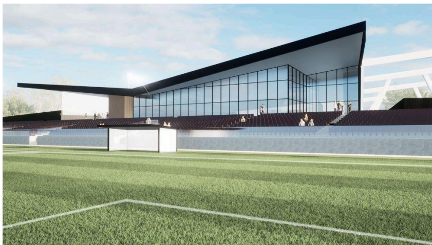
The City of Greater Geelong is investigating where it could build a regional soccer hub.

This masthead revealed in 2023 a sub regional soccer hub would be built at Armstrong Creek by 2031 .