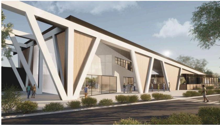
A render from one of City of Greater Geelong's proposed soccer hub.

The show pitch could host elite competitions, including National Premier League, A and W League and international fixtures, and help build stronger ties with Western United.