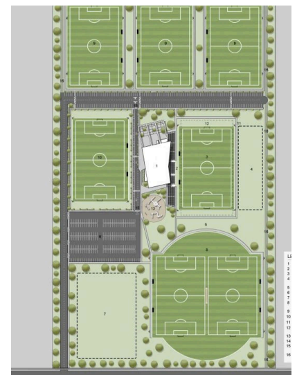
The City of Greater Geelong has plans for a new soccer hub to host crowds of up to 5000 people.