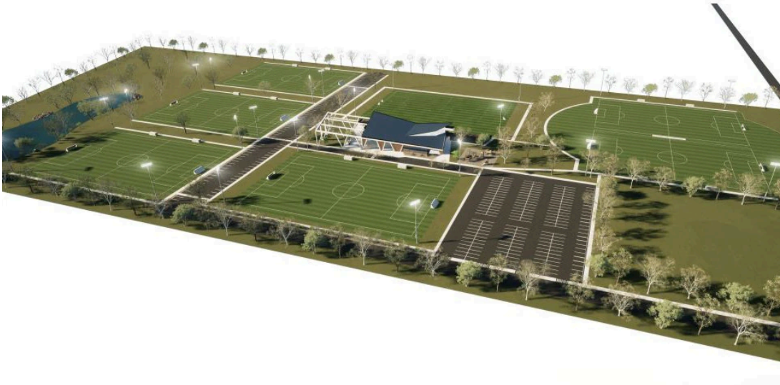
The City of Greater Geelong's proposal for a new soccer hub.

Plans have emerged for a new soccer facility which could host up to 5000 people for A-League and international fixtures.